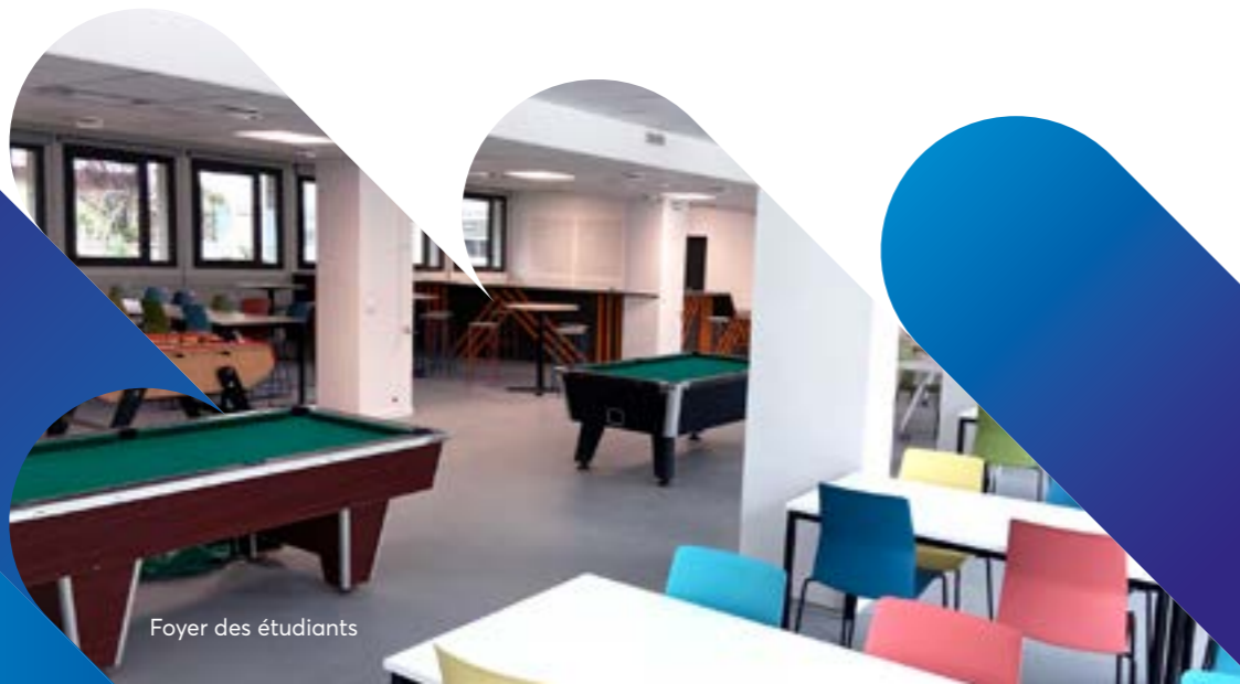
Foyer des étudiants